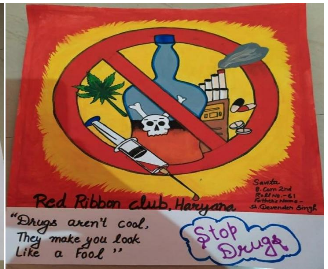
Participation in District level online poster making competition