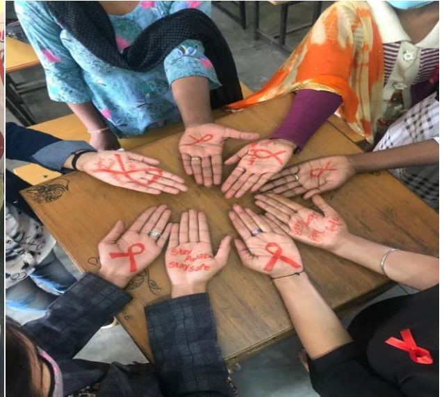
Observance of World AIDS/DAY